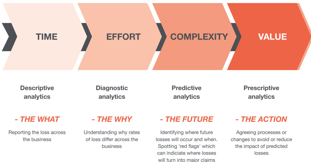
Figure 1: Analytical Capability Maturity

There is no question that a mature approach to analytics takes time and resource. Businesses will need to initially focus on getting their existing data and data infrastructure in line, before they can move up the maturity model.